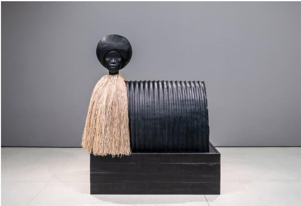
"Sentinel" (2019) by Simone Leigh, who is making a new sentinel-like female figure to be placed at the center of Tivoli Circle, where a statue of Robert E. Lee was dismantled in 2017.