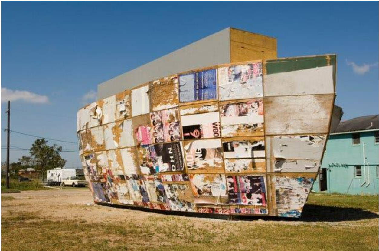
"Mithra," a three-story ark by the Los Angeles painter Mark Bradford, was shown during Prospect.1 in 2008 in an area of New Orleans that experienced some of the worst flooding from Hurricane Katrina.

The small, nimble organization rejiggered the schedule quickly after the hurricane, which knocked out power for days and set back fabrication, framing and shipping. Fifty-one art projects are scheduled to open in three waves this weekend, next Saturday and Nov. 6 (with a final piece to be unveiled in early January) across 20 cultural spaces around the city; a gala has been postponed to the last weekend of the show, which closes Jan. 23.