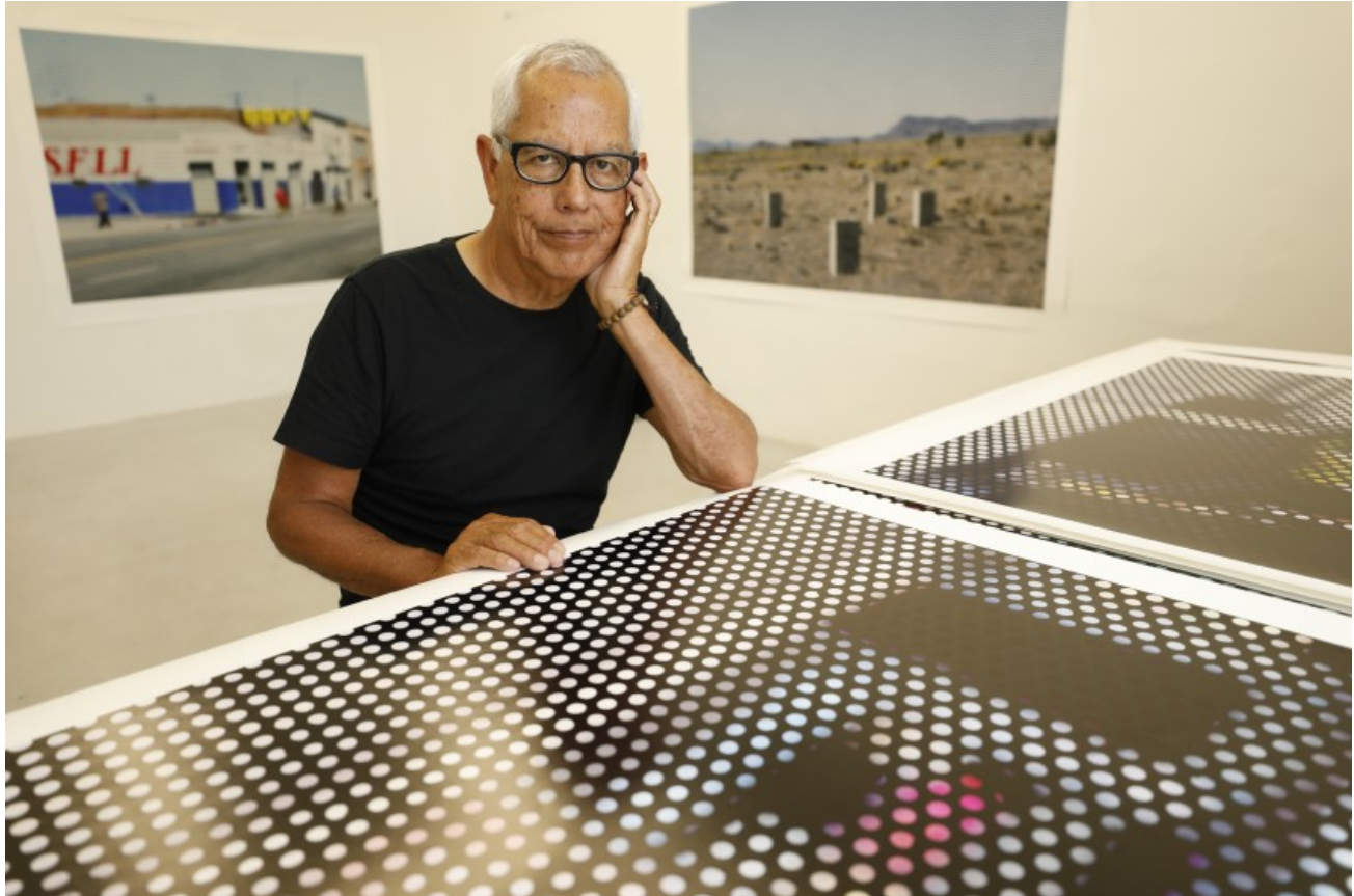
Photographer Anthony Hernandez, who is known for his unblinking photographs of Los Angeles, in his Jefferson Park studio.

For five decades, Anthony Hernandez, who was born and raised on L.A.'s Eastside — first in Boyle Heights, then East Los Angeles — has quietly chronicled the city's rougher edges. His earliest experiments were with street photography, capturing Angelenos caught in private worlds as they moved around the city.