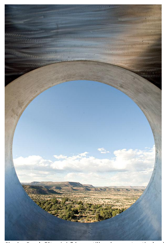
The view of the desert in New Mexico from Charles Ross's "Star Axis" (1971-still under construction), a land art sculpture that the artist has been working on for several decades. Charles Ross 2018

Rodin and Duchamp toiled away on pieces for spectacular lengths of time. But in an era of digital hyperdrive, fidelity to one work seems even more heroic.