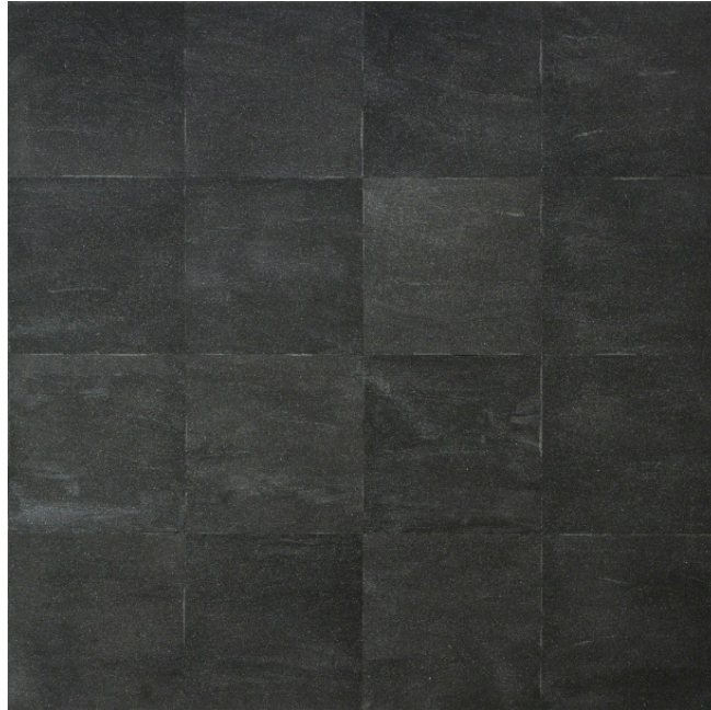
Mary Corse, Untitled (black painting) , 1987, Heather James Fine Art

Untitled (white painting) (circa 1990) and Untitled (black painting) (1987), two large-scale paintings, employ a light sensitive material that has become synonymous with Corse's practice—the glass microsphere. By combining acrylic with the miniature crystalline balls, Corse builds monochromatic, subtly geometric compositions that have an inexhaustible capacity for transformation. The longer you look at, move around, or live with them, the more facets are revealed—some meditative, others unexpected and wild. One might say that beholding Corse's work reveals new dimensions, not only of the painting but also of perception itself.