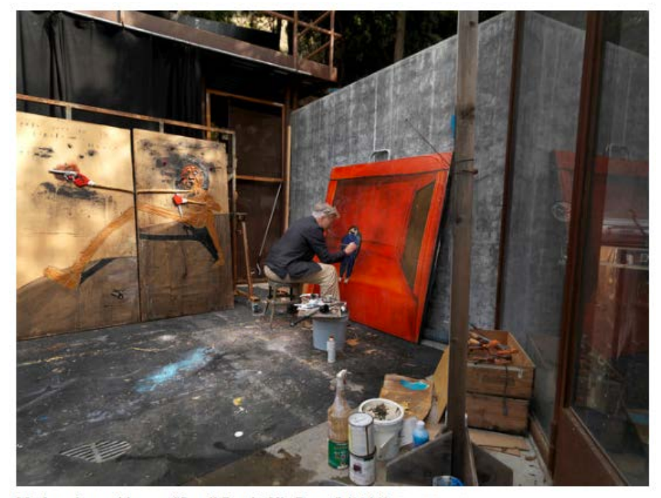
Mr. Lynch, working on "Small Boy in His Room" (2009). David Lynch

LOS ANGELES — <u>David Lynch</u>'s rooftop painting studio, perched high in the Hollywood Hills, is littered with the byproduct of work. Paintings with crude, childlike figures doing menacing things lean up against the walls, unfinished drawings are strewn over his huge desk, and the floor is carpeted with cigarette butts. While the dark visual sensibility of his film work — "Eraserhead" (1977), "The Elephant Man" (1980), "Blue Velvet" (1986), "Wild at Heart" (1990), "Mulholland Drive" (2001), and his TV series "Twin Peaks" (1990-91) — has permeated the public consciousness and widely influenced other filmmakers, writers and artists (including Cindy Sherman and Gregory Crewdson), Mr. Lynch's own visual art is almost unknown. Yet painting is where he started, enrolled as an advanced student at the Pennsylvania Academy of the Fine Arts in Philadelphia in 1966 and '67, and it is the medium he continues to work in most actively. His first United States museum retrospective, "David Lynch: The Unified Field," opens at the Pennsylvania Academy on Sept. 13.