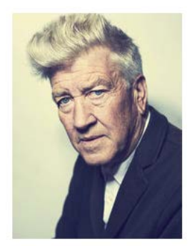
David Lynch studied art in Philadelphia before gravitating to film.

LOS ANGELES — <u>David Lynch</u>'s rooftop painting studio, perched high in the Hollywood Hills, is littered with the byproduct of work. Paintings with crude, childlike figures doing menacing things lean up against the walls, unfinished drawings are strewn over his huge desk, and the floor is carpeted with cigarette butts. While the dark visual sensibility of his film work — "Eraserhead" (1977), "The Elephant Man" (1980), "Blue Velvet" (1986), "Wild at Heart" (1990), "Mulholland Drive" (2001), and his TV series "Twin Peaks" (1990-91) — has permeated the public consciousness and widely influenced other filmmakers, writers and artists (including Cindy Sherman and Gregory Crewdson), Mr. Lynch's own visual art is almost unknown. Yet painting is where he started, enrolled as an advanced student at the Pennsylvania Academy of the Fine Arts in Philadelphia in 1966 and '67, and it is the medium he continues to work in most actively. His first United States museum retrospective, "David Lynch: The Unified Field," opens at the Pennsylvania Academy on Sept. 13.